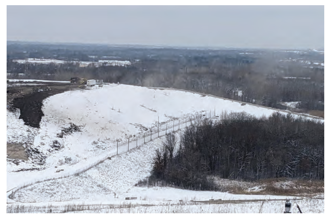
Cover placed as working face meets grade to shape East slope