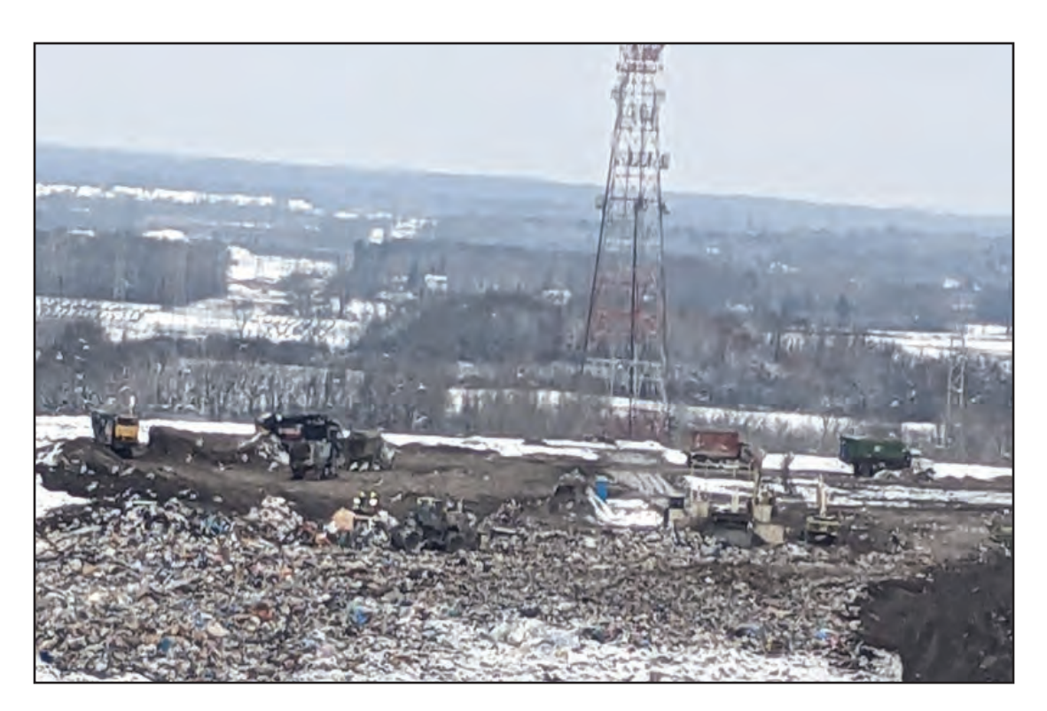
Truck clean out Phase 2b