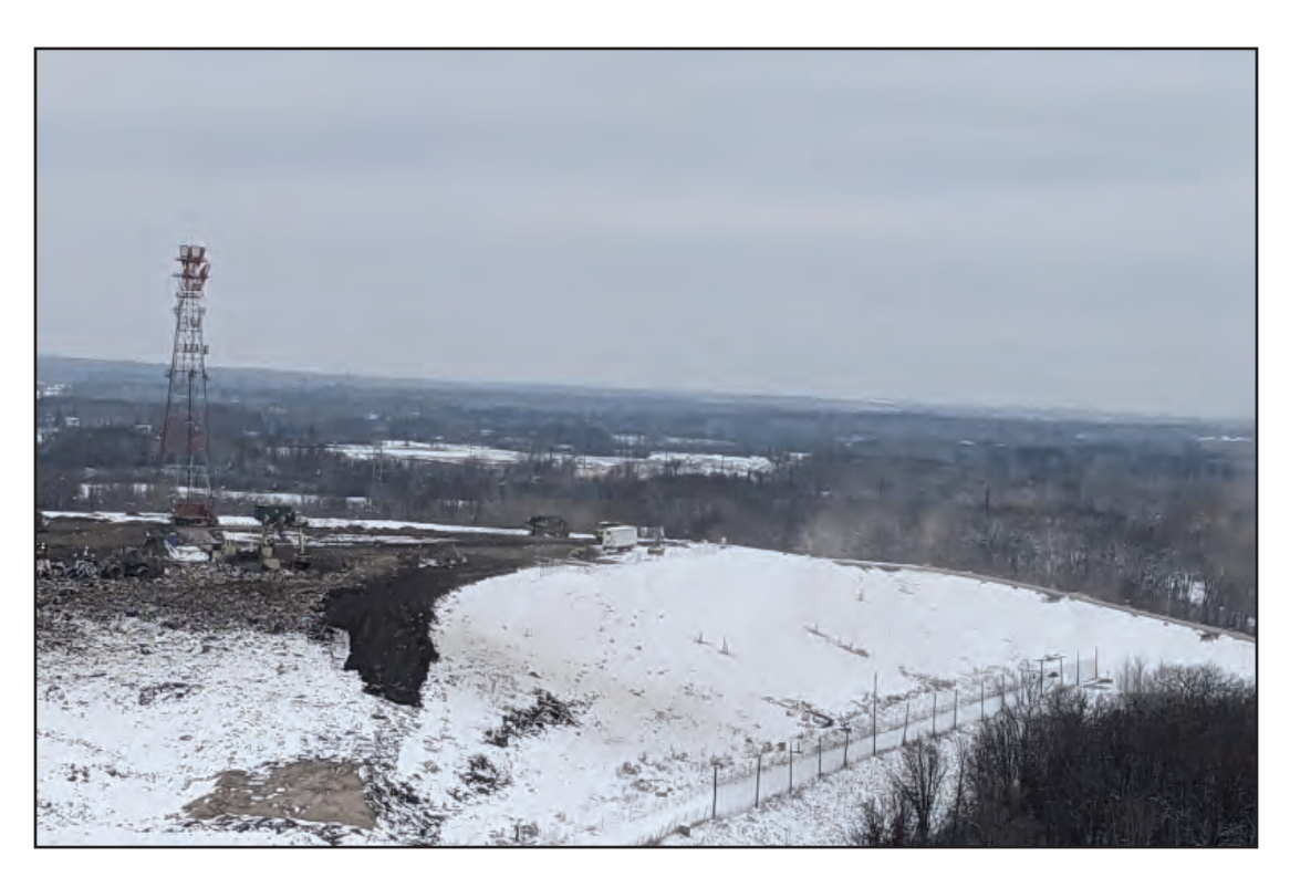
Working face on East edge of Phase 2, West edge of Phase 1