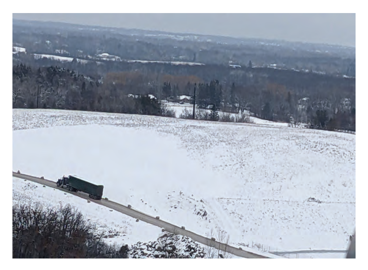
Access road passing stockpile pror to North Expansion West