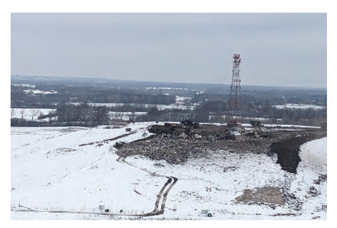
Southwest corner of Phase 2B, receiving some waste to shae corner