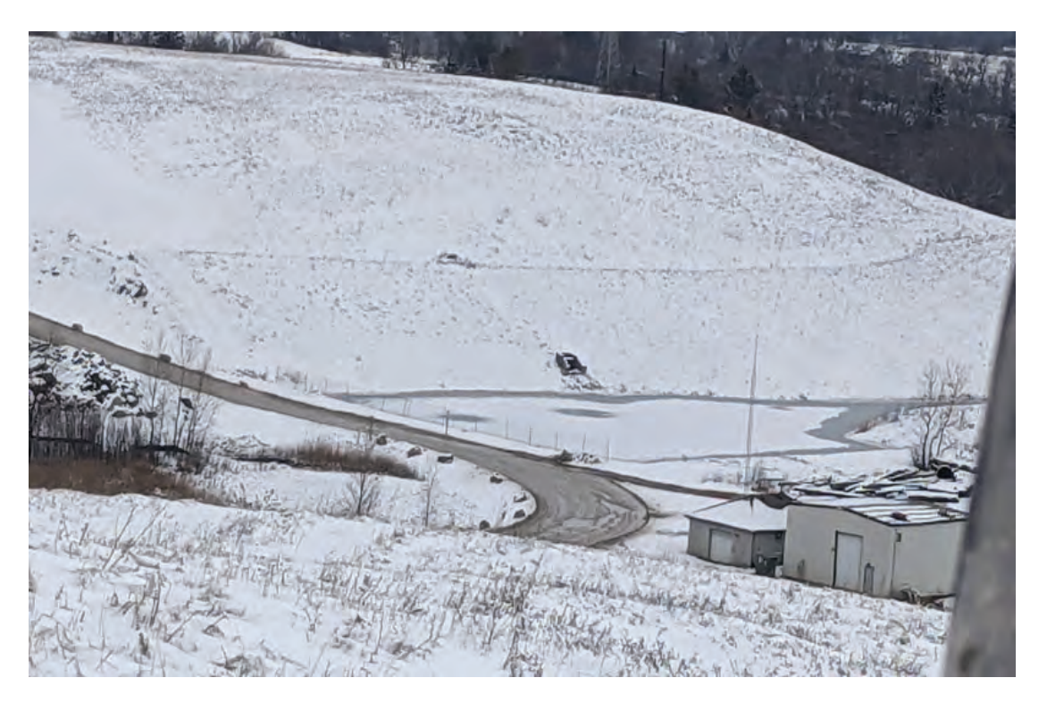
Start at access road by pretreatment plant