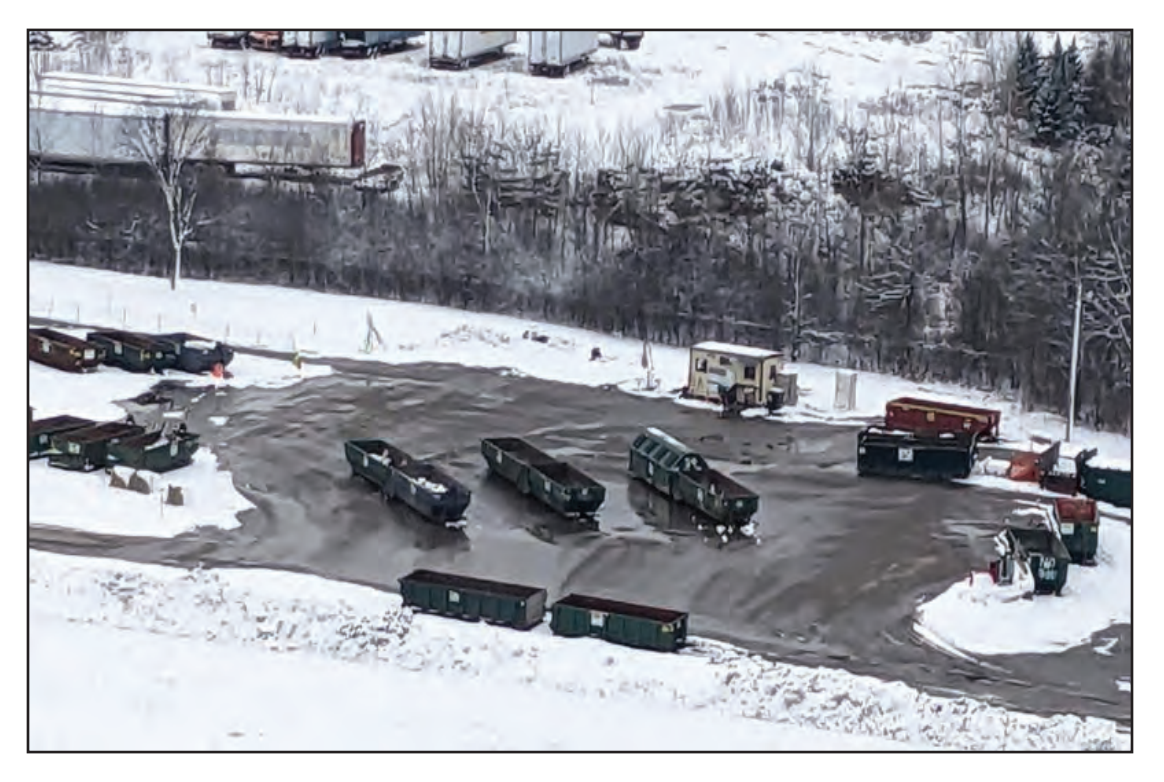
Resi-drop-off, clean and cleared of snow