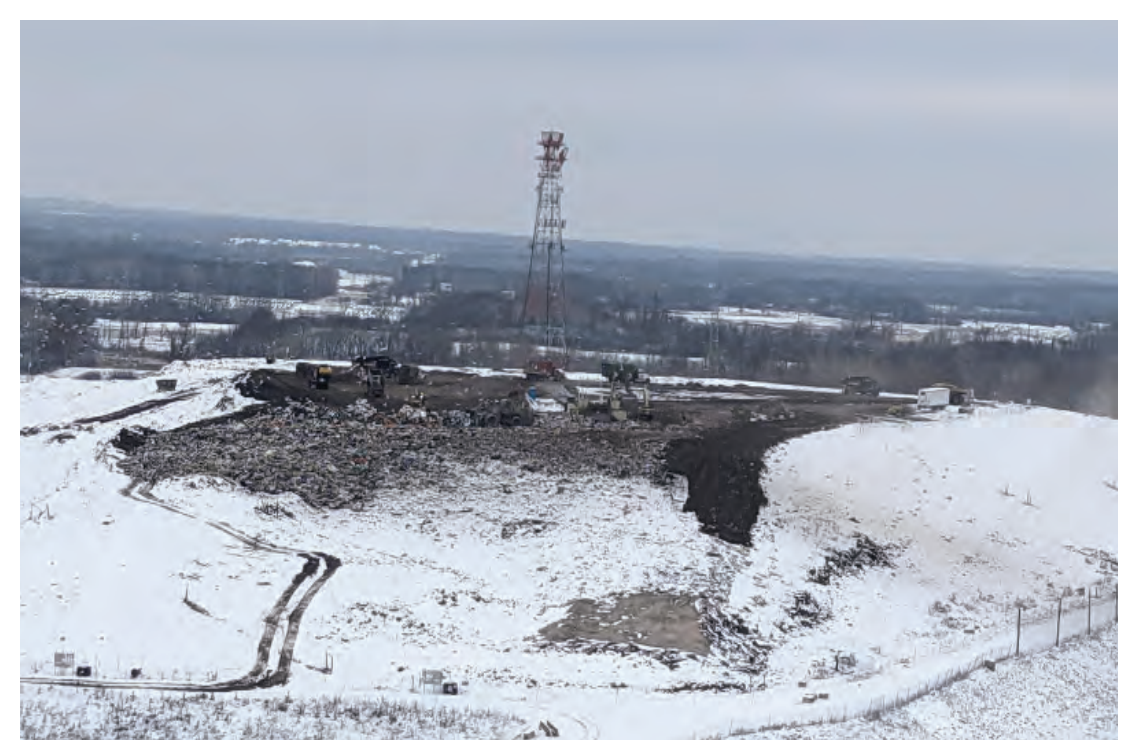
Over all view of Phase 2