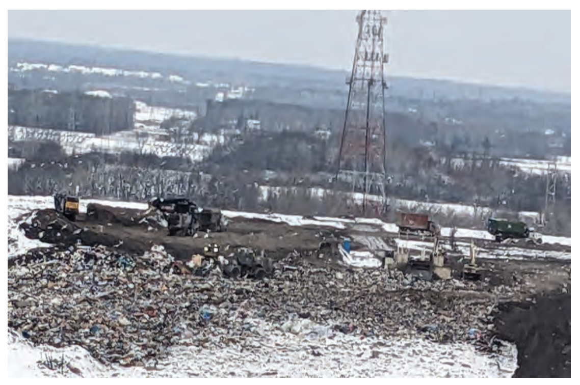
Top of Phase 2 receiving waste and clean-out of trucks